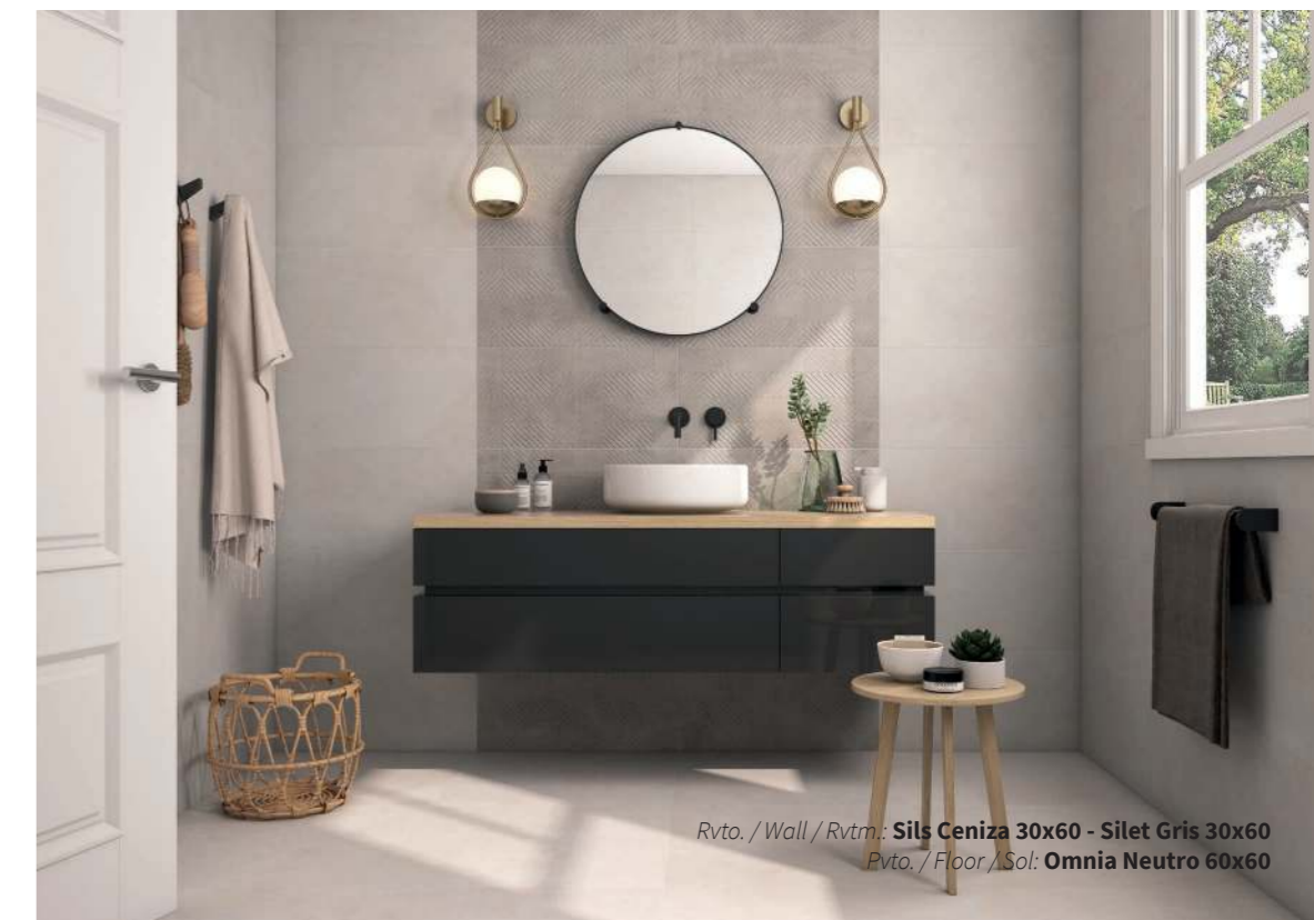
Rvto. / Wall / Rvtrm.: Sils Ceniza 30x60 - Silet Gris 30x60 Pvto. / Floor / Sol.: Omnia Neutro 60x60

• Silet Gris 30x60 Rec. M26 031.547.0002.08919