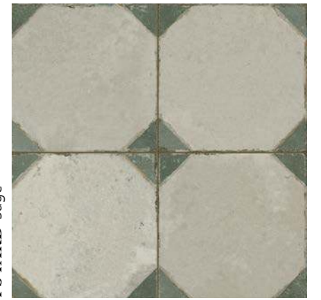
FS YARD Sage