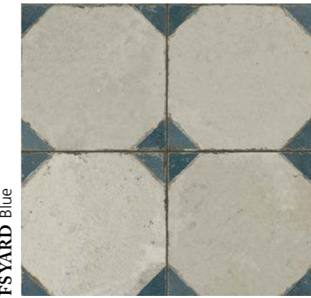
FS YARD Blue