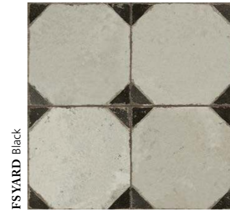
FS YARD Black