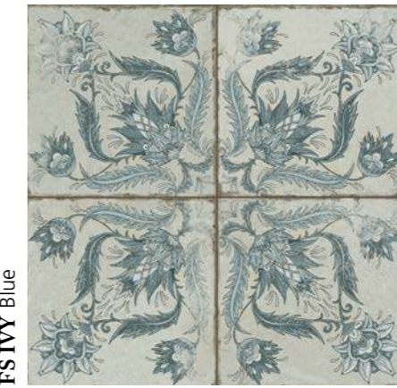
FS IVY Blue