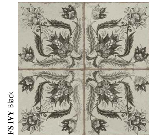
FS IVY Black