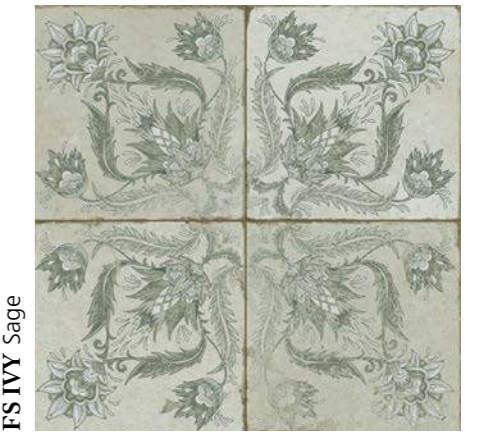
FS IVY Sage