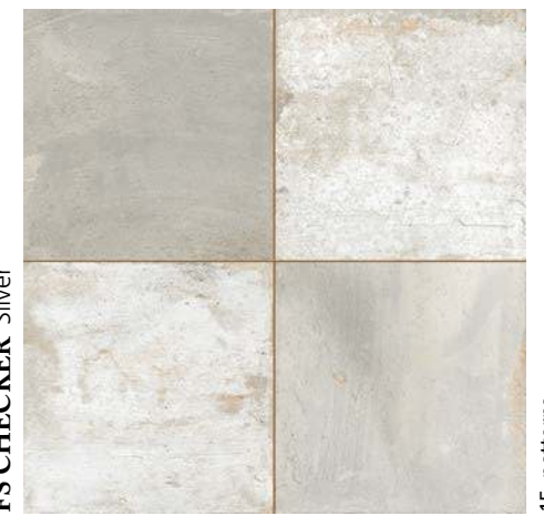
FS CHECKER Silver