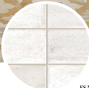
FS Mud White