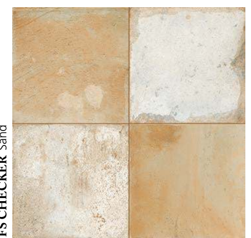
FS CHECKER Sand