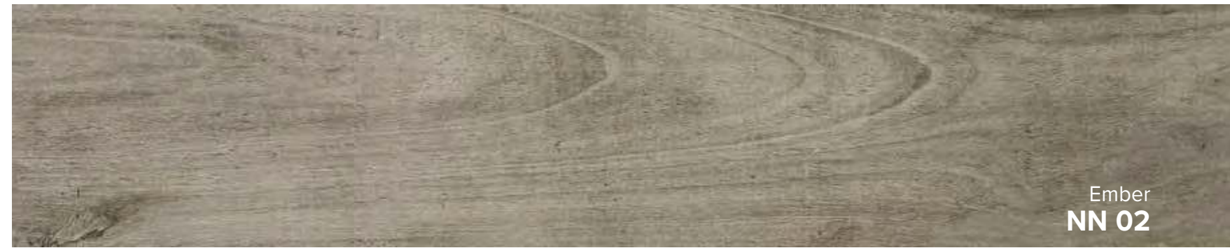
Ember NN 02