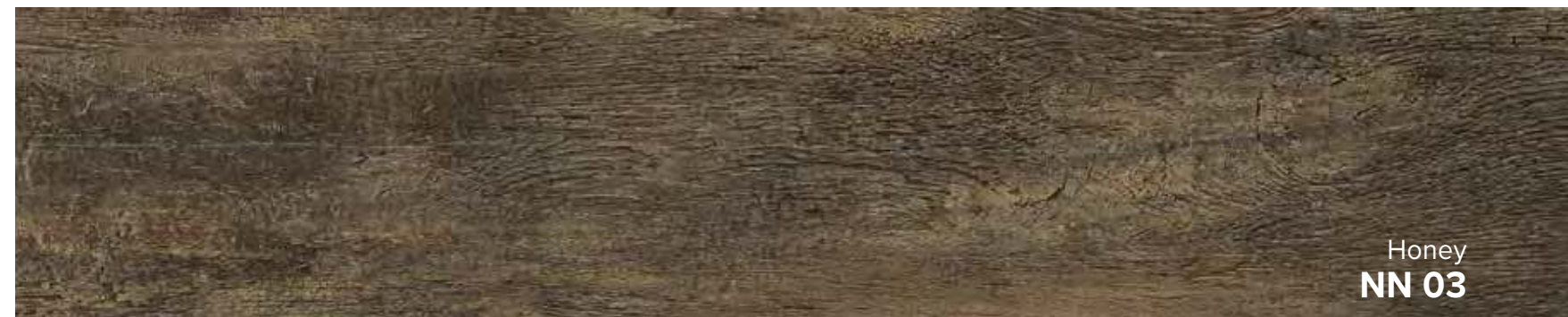
Honey NN 03