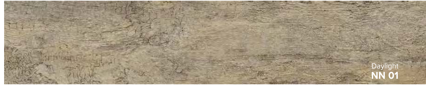
Daylight NN 01