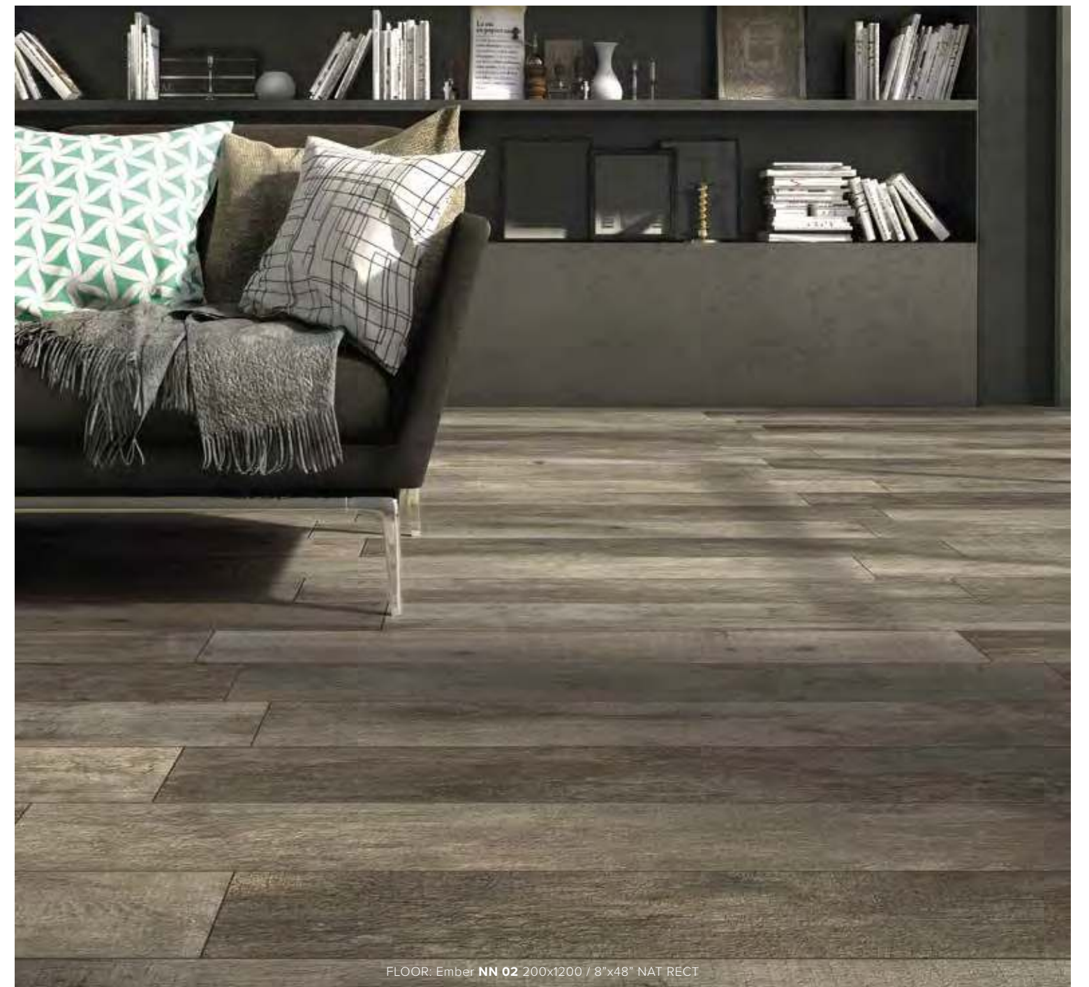
FLOOR: Ember NN 02 200x1200 / 8"x48" NAT RECT

The collection brings together the warmth and the elegance of natural wood, with all the outstanding technical features of Mirage® porcelain stoneware: wear resistance and durability.