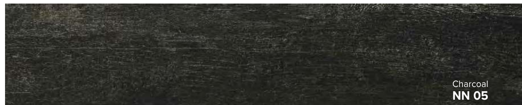
Charcoal NN 05

OUTDOOR FLOOR: Ember NN 02 200x1200 / 8"x48" RD RECT EVO_2/E" ± 20 mm