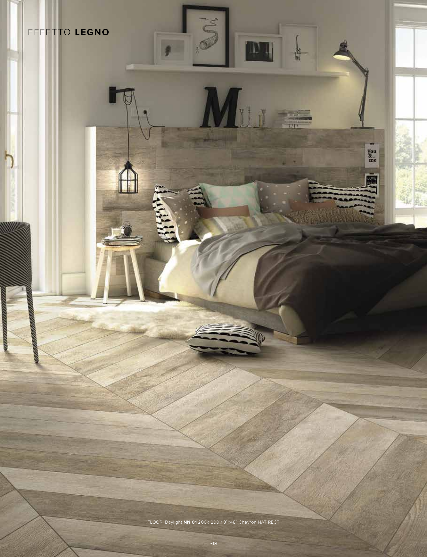
FLOOR: Daylight NN 01 200x1200 / 8"x48" Chevron NAT RECT