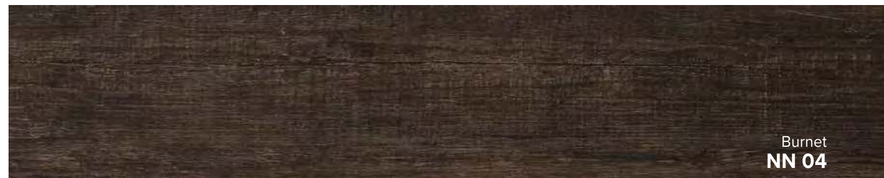
Burnet NN 04