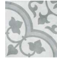
23288 CUBAN SILVER ORNATE/22.3 Q6 (22.3x22.3 cm) (8 3/4 x8 3/4 ") 5 patterns