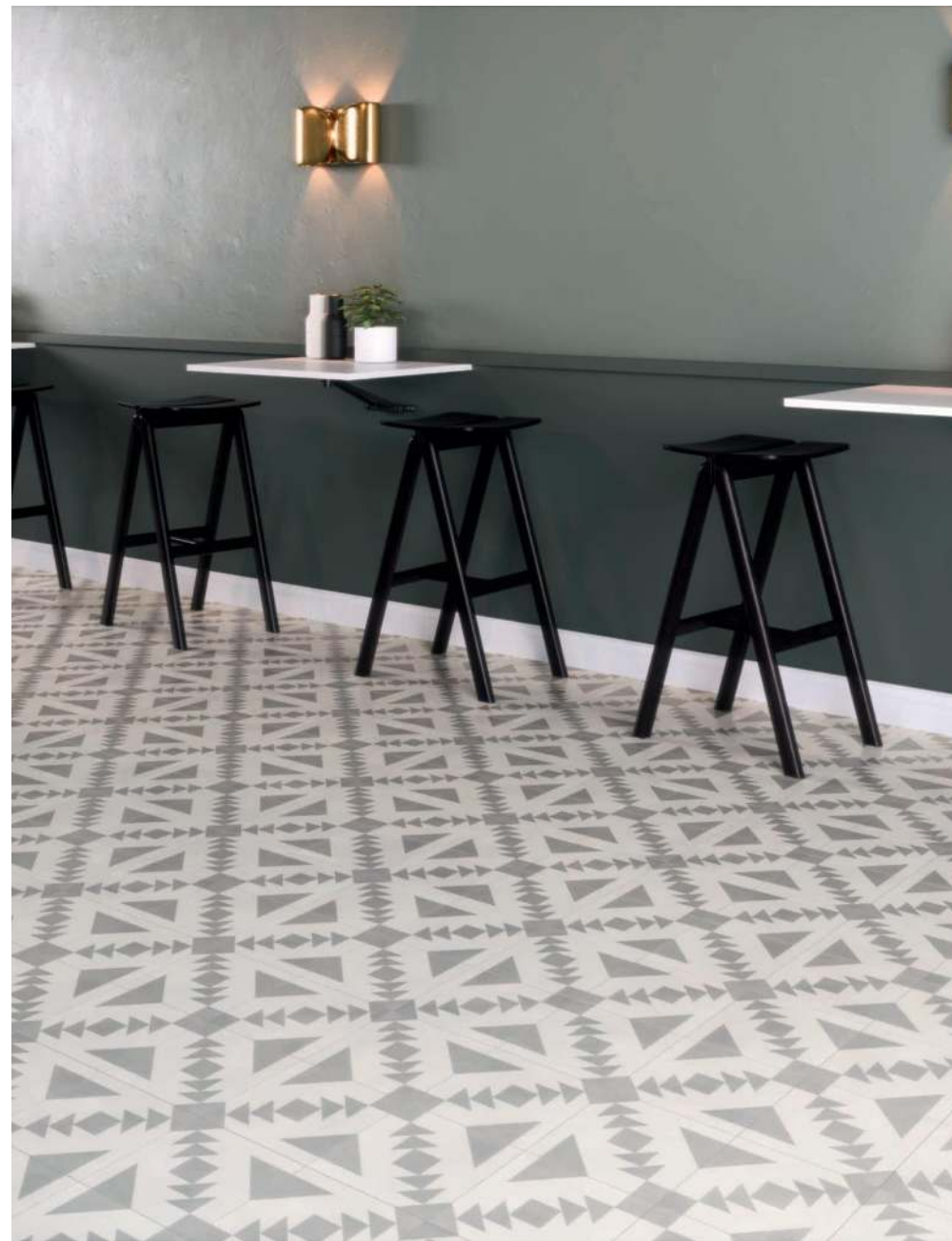
CUBAN SILVER ARROW/22,3