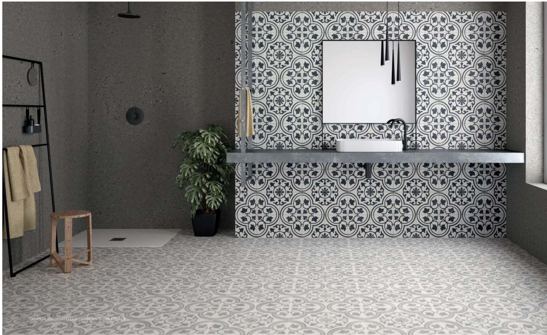
CUBAN SILVER ORNATE/22,3 : CUBAN WHITE ORNATE/22,3