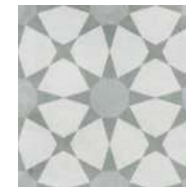
23287 CUBAN SILVER STAR/22.3 Q6 (22.3x22.3 cm) (8 3/4 x8 3/4 ") 5 patterns