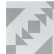
23285 CUBAN SILVER ARROW/22.3 Q6 (22.3x22.3 cm) (8 3/4 x8 3/4 ") 5 patterns