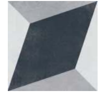
23290 CUBAN BLOCK/22.3 Q6 (22.3x22.3 cm) (8 3/4 x8 3/4 ") 5 patterns