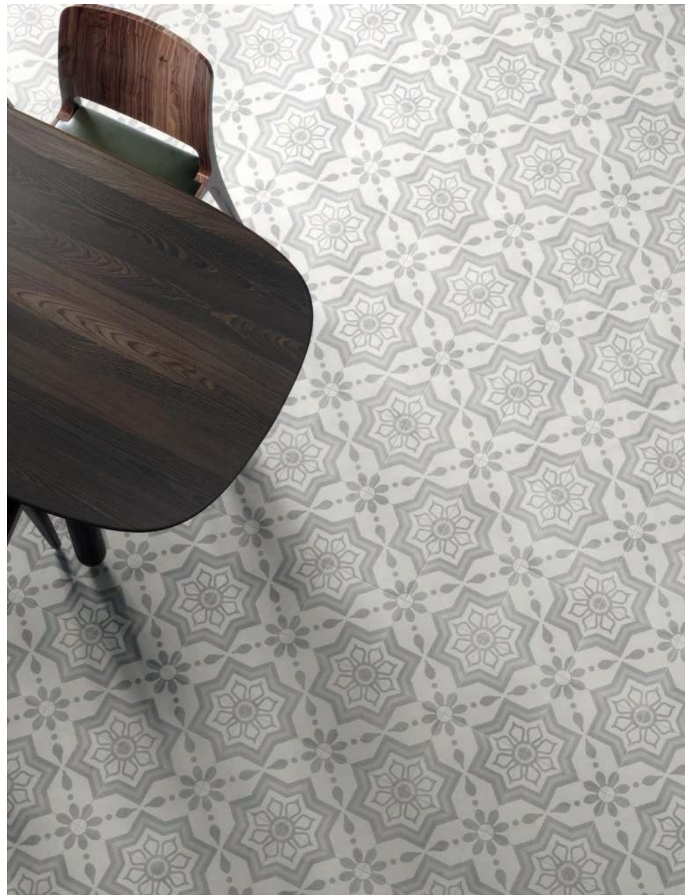
CUBAN SILVER SKY/22,3

Esencia modernista a través de gráficas geométricas y ornamentales que nos trasladan al principio del siglo XX. La colección CUBAN rescata la tendencia hidráulica para renovarla en material porcelánico de formato 22.3x22.3 cm. Las referencias, de diferentes motivos gráficos, se presentan en dos gamas cromáticas diferentes, una que combina diferentes intensidades de gris y otra con una mayor contraposición que combina el color Blanco con el Negro.