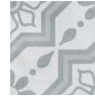
23289 CUBAN SILVER SKY/22.3 Q6 (22.3x22.3 cm) (8 3/4 x8 3/4 ") 5 patterns