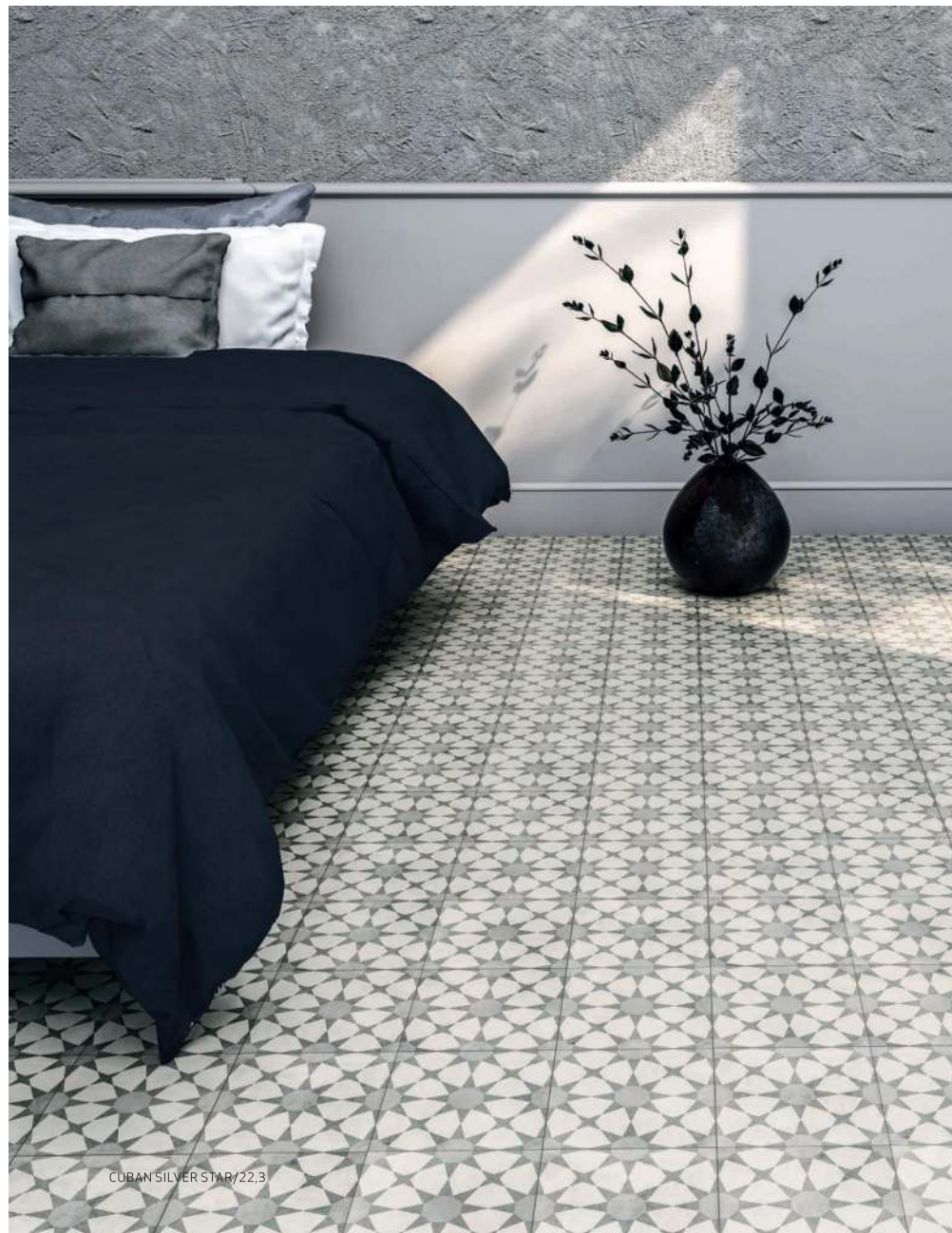
CUBAN SILVER STAR/22,3