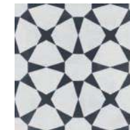
23284 CUBAN WHITE STAR/22.3 Q6 (22.3x22.3 cm) (8 3/4 x8 3/4 ") 5 patterns