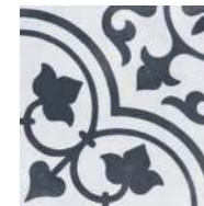
23286 CUBAN WHITE ORNATE/22.3 Q6 (22.3x22.3 cm) (8 3/4 x8 3/4 ") 5 patterns