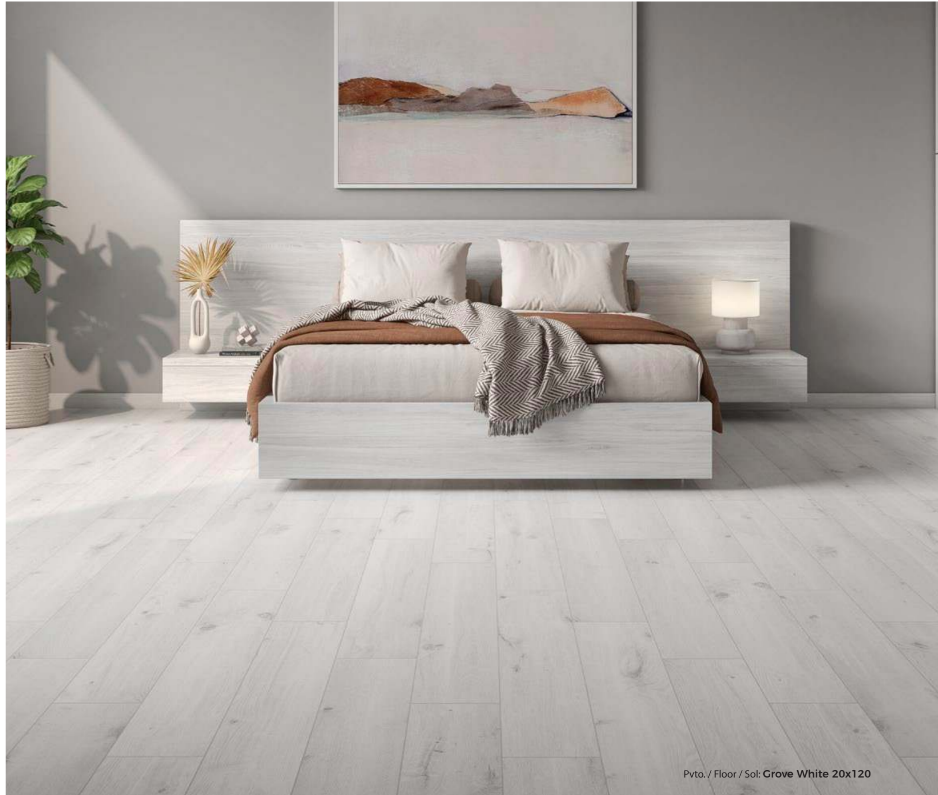
Pvto. / Floor / Sol: Grove White 20x120