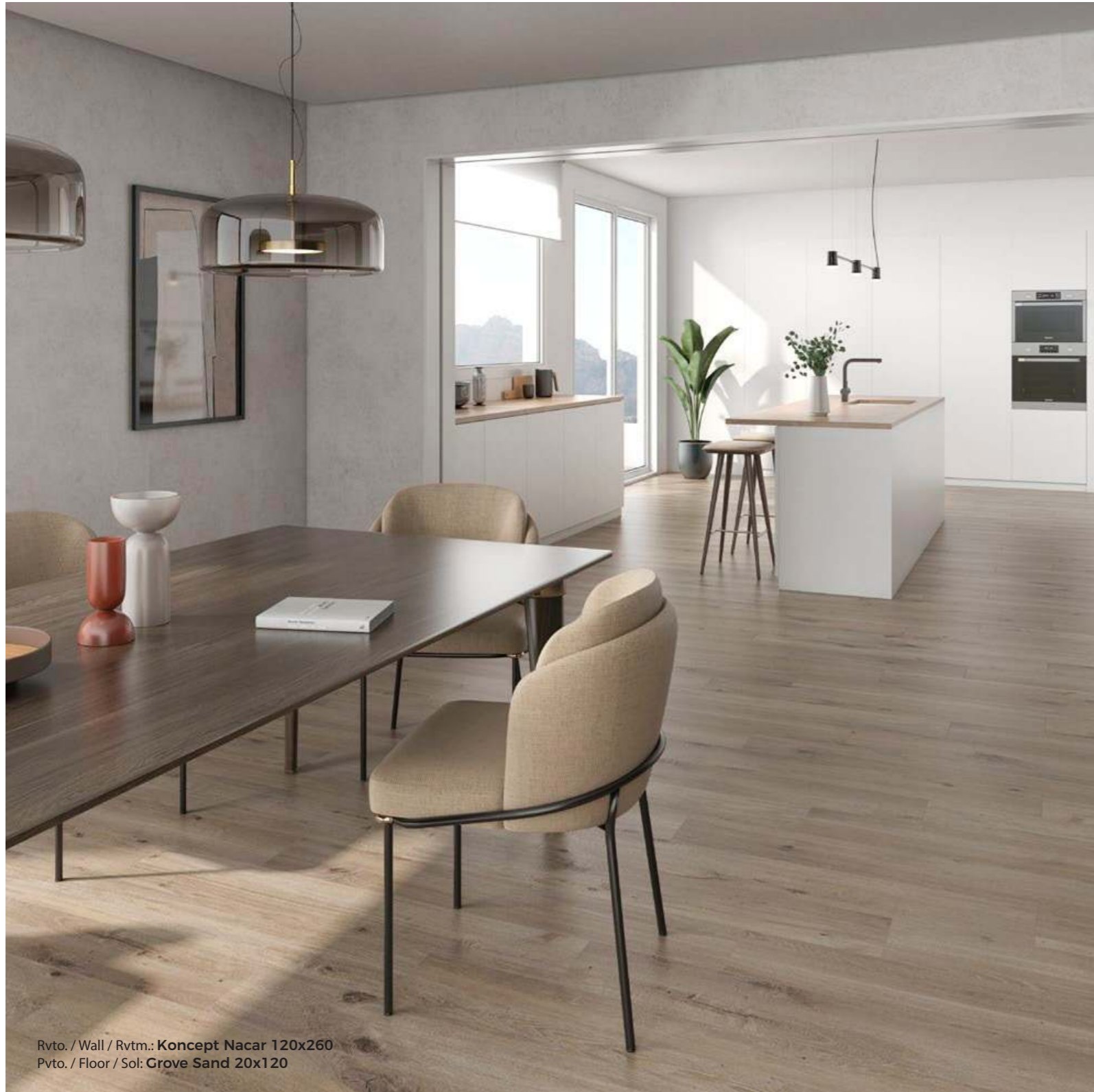
Rvto. / Wall / Rvrm.: Koncept Nacar 120x260 Pvto. / Floor / Sol: Grove Sand 20x120