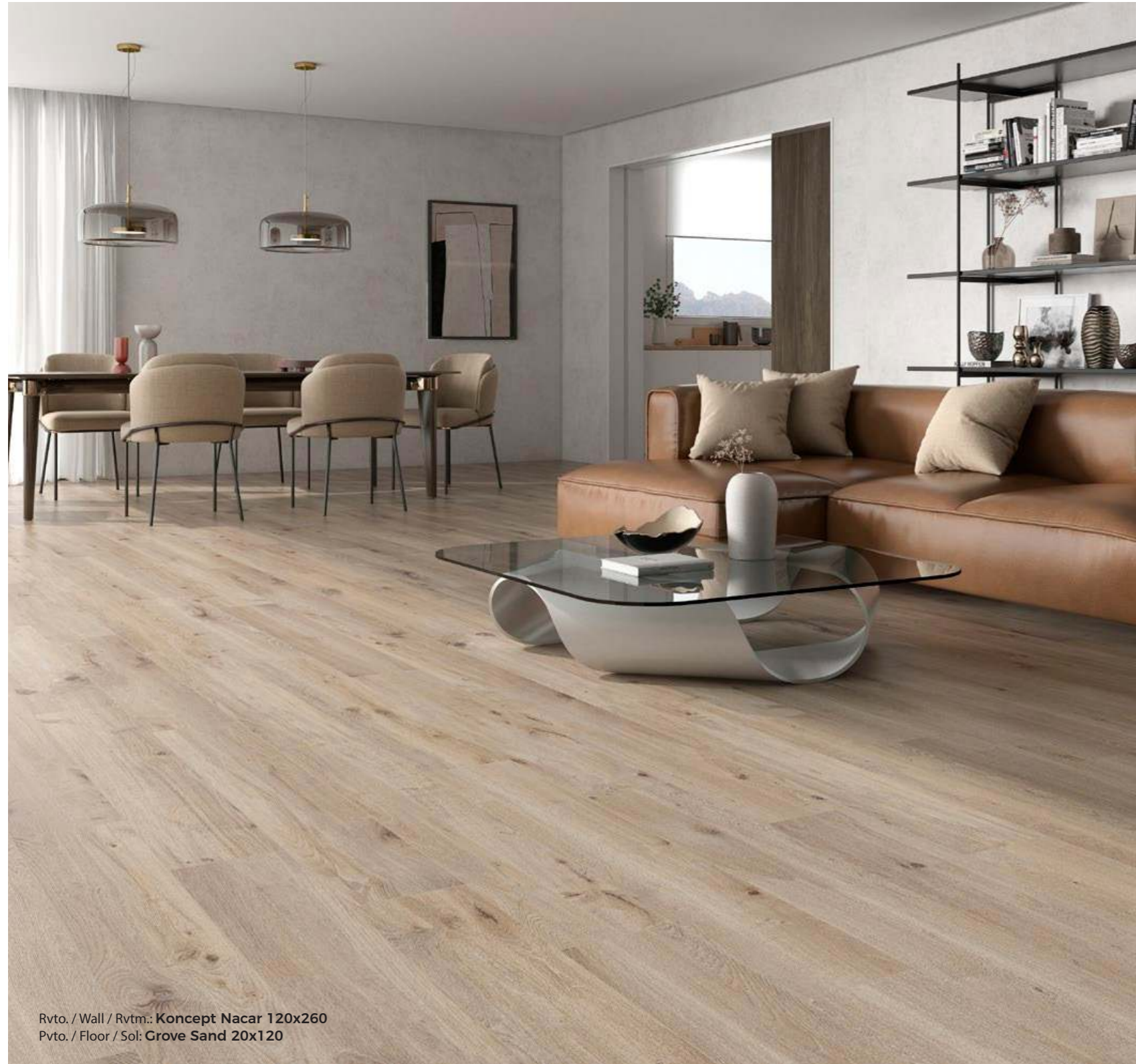
Rvto. / Wall / Rvtm.: Koncept Nacar 120x260 Pvto. / Floor / Sol: Grove Sand 20x120