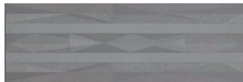
• Rlv. Brienz Marengo 33,3x100 Rec. M48 031.627.0028.03817