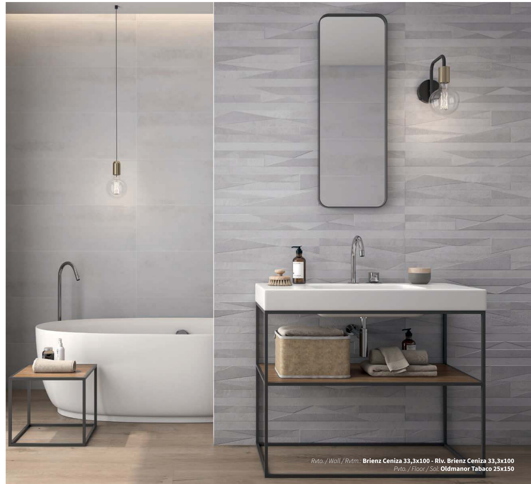
Rvto. / Wall / Rvrm.: Brienz Ceniza 33,3x100 - Rlv. Brienz Ceniza 33,3x100 Pvto. / Floor / Sol: Oldmanor Tabaco 25x150