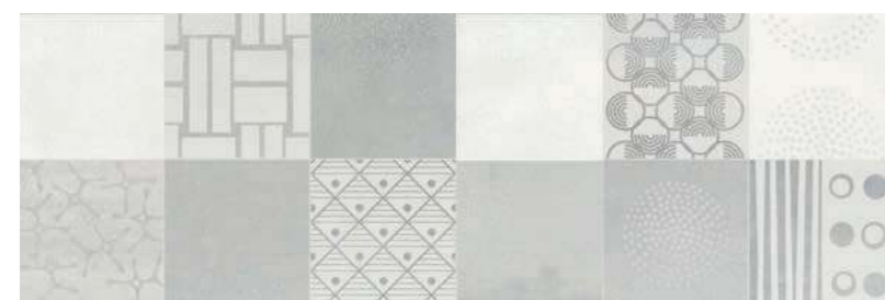
• Dec. Brienz Ceniza 33,3x100 Rec. M48 031.627.0019.03820