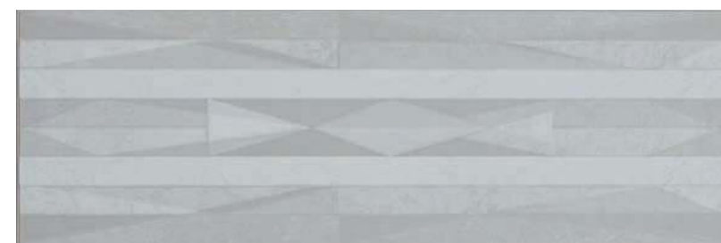
• Rlv. Brienz Ceniza 33,3x100 Rec. M48 031.627.0019.03817