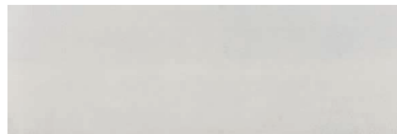
• Brienz Blanco 33,3x100 Rec. M48 031.627.0012.02985