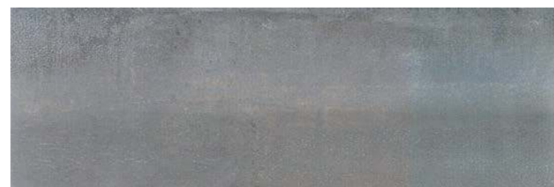
• Brienz Marengo 33,3x100 Rec. M48 031.627.0028.02985