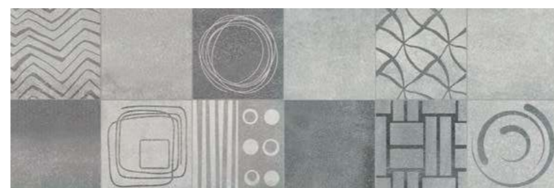
• Dec. Brienz Marengo 33,3x100 Rec. M48 031.627.0028.03820