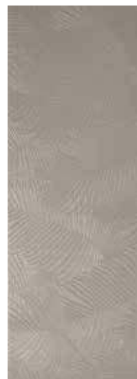
KENTIA SILVER RECT. 31,6X90 / 12,5"X36" T45/M