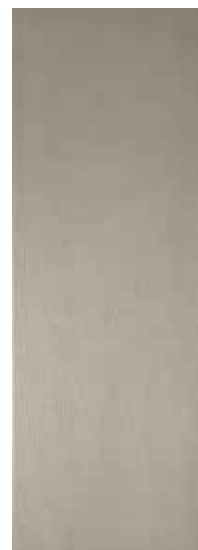
CRAYON SILVER RECT. 31,6X90 / 12,5"X36" T07/M