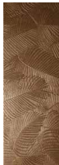
KENTIA BRONZE RECT. 31,6X90 / 12,5"X36" T45/M