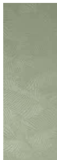
KENTIA GREEN RECT. 31,6X90 / 12,5"X36" T04/M