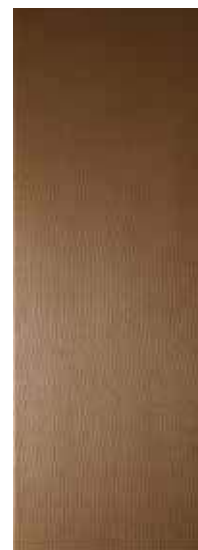
CRAYON BRONZE RECT. 31,6X90 / 12,5"X36" T07/M