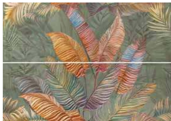
DECOR SET(2) VERGEL 31,6X90 / 12,5"X36" T42/P