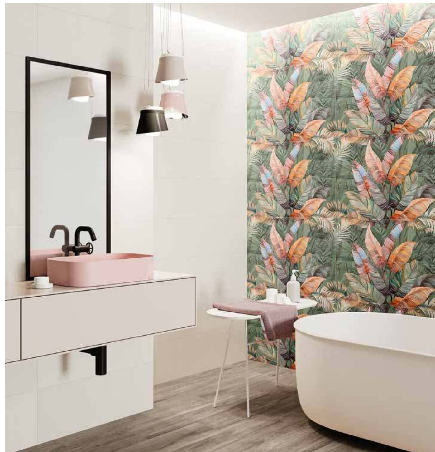
CRAYON WHITE RECT 31,6X90, DECOR SET(2) VERGEL 31,6X90, ALABAMA QUERCIA RECT. 20X120.